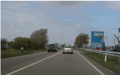
1 Driving in northern direction on the motorway N9, at the junction with traffic light near the airport it will change in N250. Follow the Texel (ferry) direction at this junction.