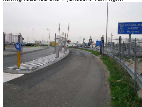
6 At the end of the lane there is an unmanned Navy gate. Report at the Navy security (intercom) that ENDURES is the destination.