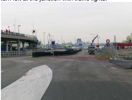
5 Do not follow the road towards the ferry station, but enter the lane on the right side.