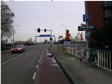
3 Immediately after having crossed the bridge turn left at the junction with traffic lights.