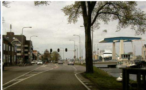
2 After having passed the notification of Den Helder city, turn right at the junction with first traffic light..