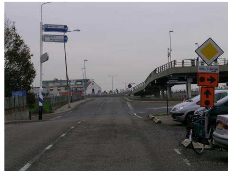
4 Following the road, pass another bridge until having reached this T-junction. Turn right.